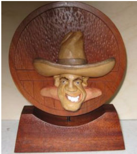
Bill Buckler's rendition of February's blank of the month