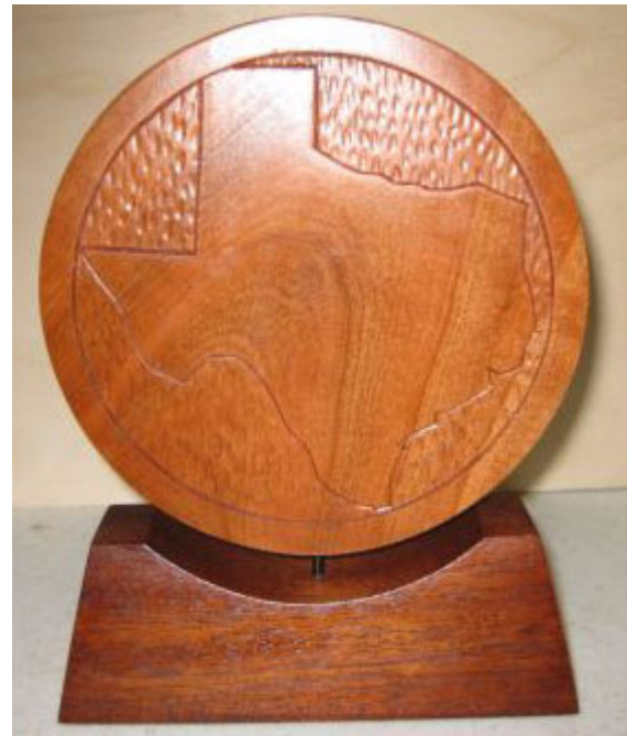
The back of Bill's work