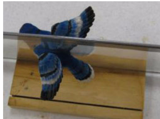
Partial top view of Jim's 2-piece bird