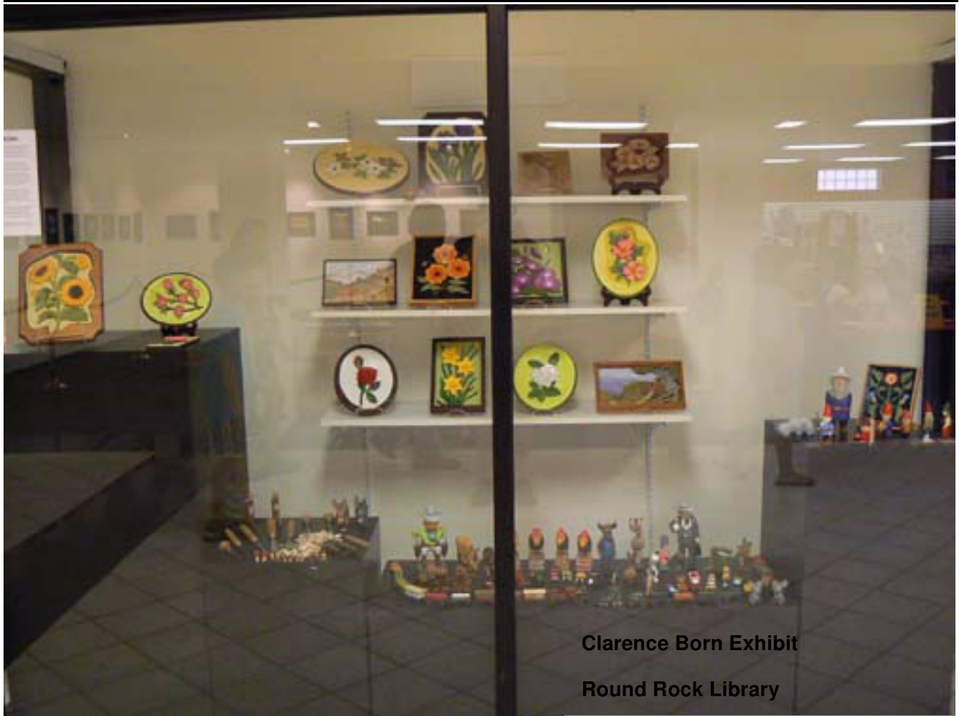
Clarence Born Exhibit Round Rock Library