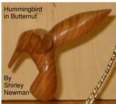
Hummingbird in Butternut