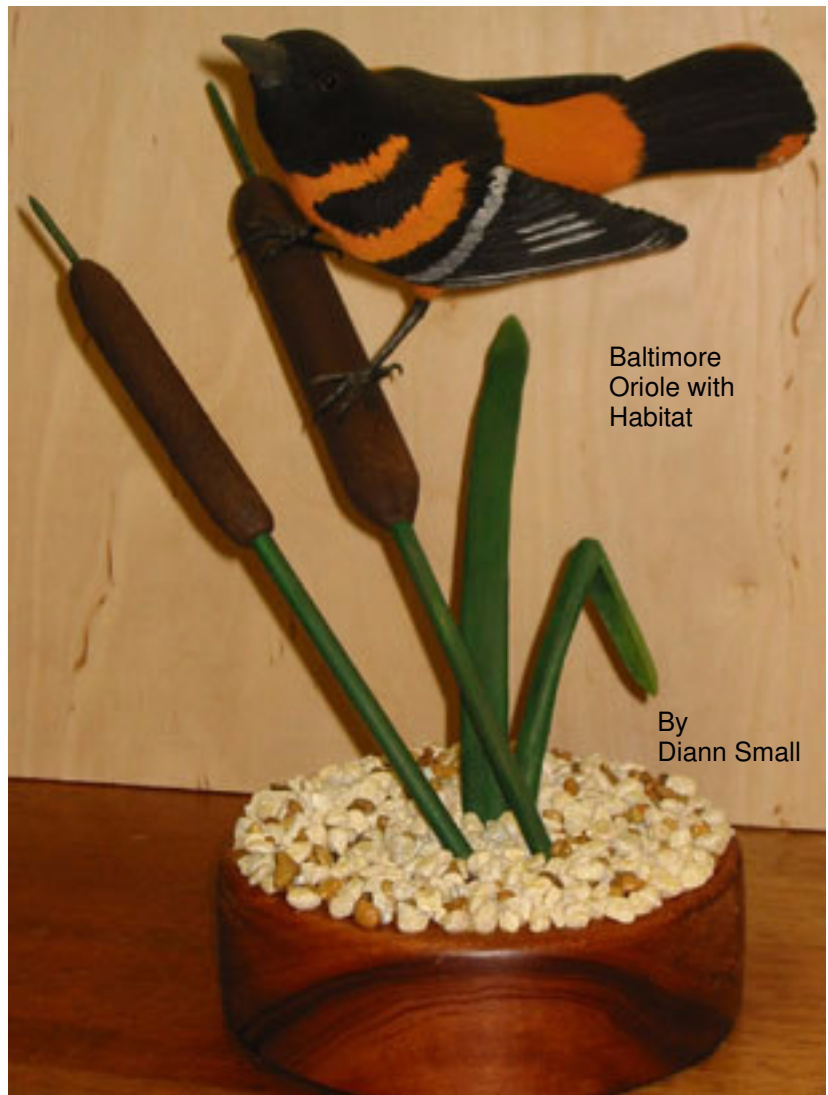
Baltimore Oriole with Habitat

Next meeting Thursday, July 9 Austin Woodcraft Store 7:00 PM