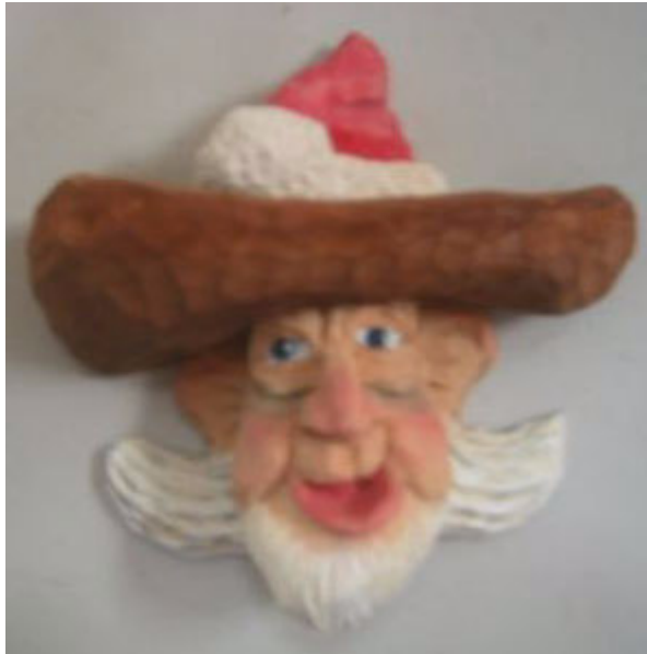
Tom Sarff's example go-by for February blank of the month