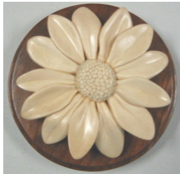
Bill Buckler's January Blank of the Month