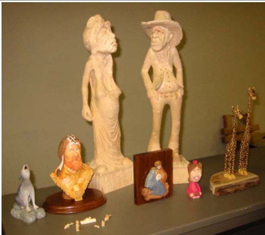
September's Show & Tell Table