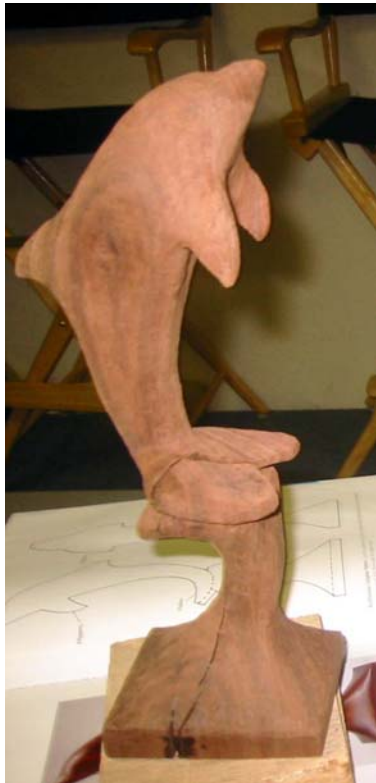
Buddy Streeman's Dolphin