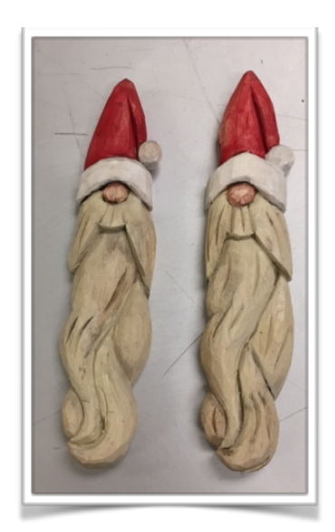
The Cutting Edge 3