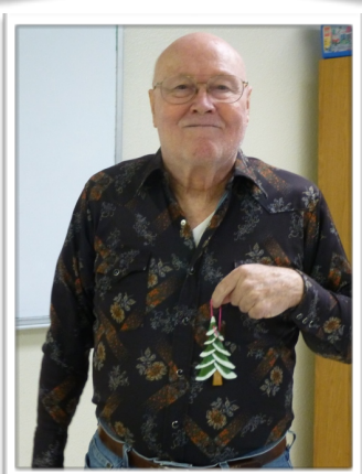
The Cutting Edge

Clarence will check with the Hancock Center to see if we can expand our meeting time to begin one hour earlier each month, from 6 PM to 9 PM (currently it is reserved from 7 PM to 9 PM). Several of us showed up early this month and it did not seem to be a problem. With the expanded hours, we are encouraged to carve during the meeting.