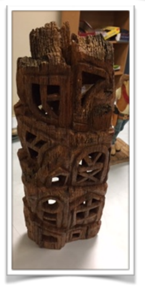
The Cutting Edge