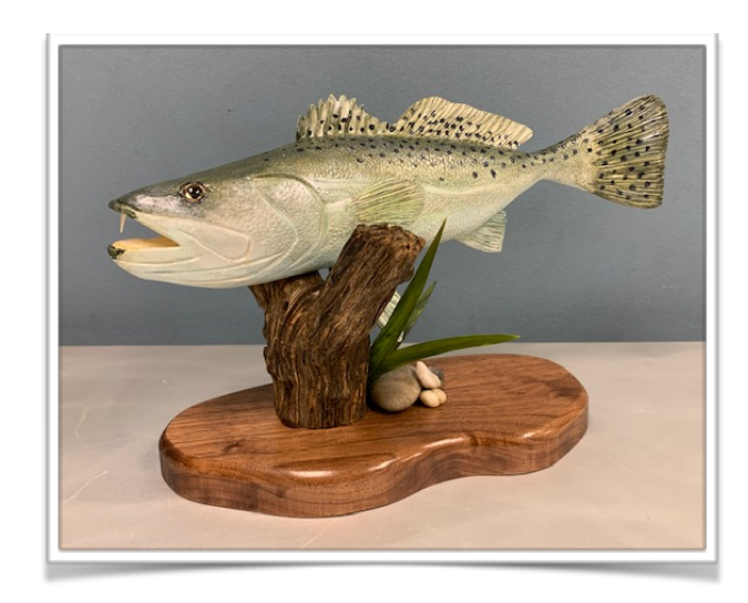
The Cutting Edge

Betty carved and handpainted a speckled trout for her grandson.