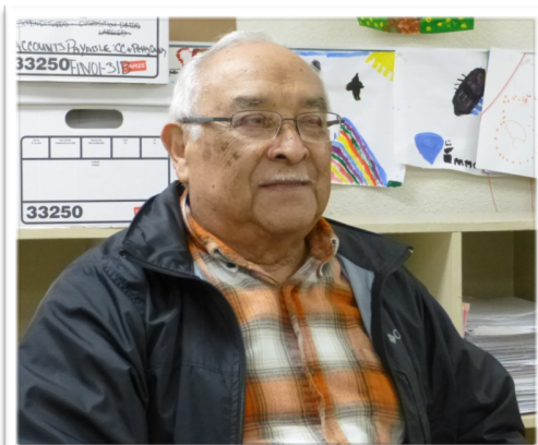
The Cutting Edge