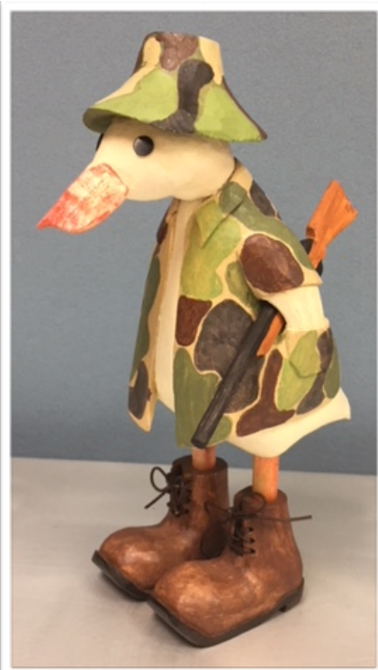
Dan carved a duck hunter from Wanda's blank, a fish from butternut, and a mouse with big ears.