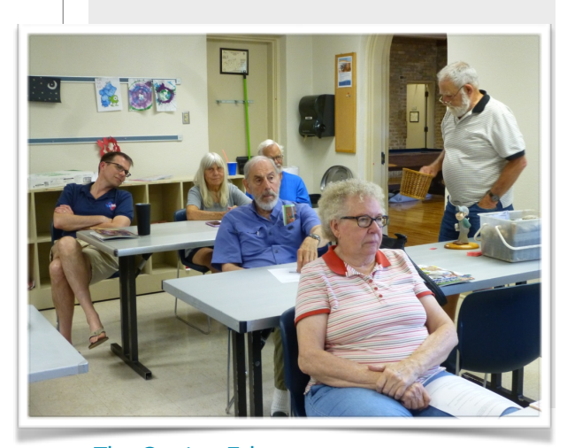
The Cutting Edge