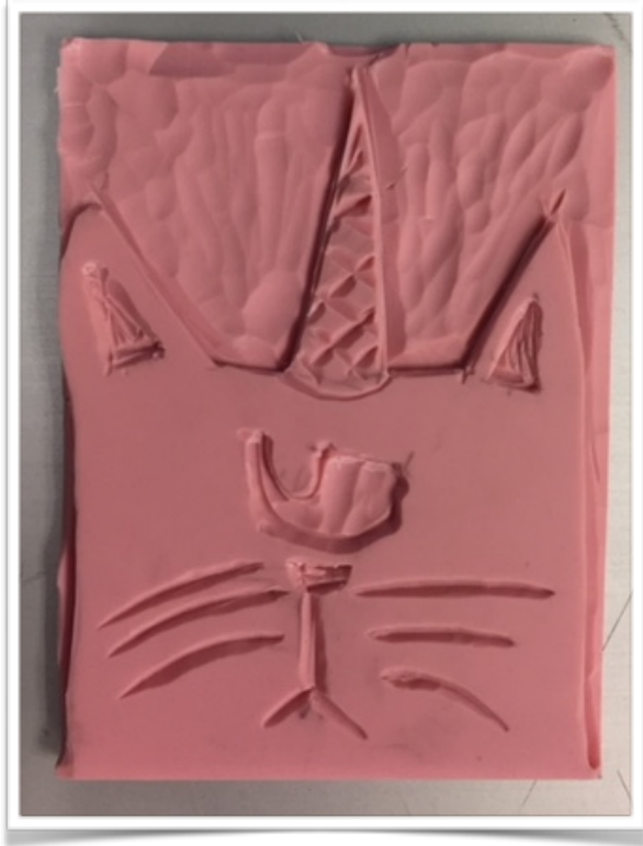
Ellie (Lu's daughter) carved a Blank-of-the-Month to a Waffle-unicorn-cyclops kitty.