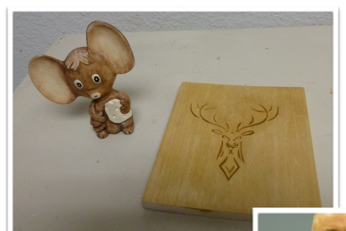
Dan had a carving of a big-mouthed mouse with cheese, and a chip carving of a deer.