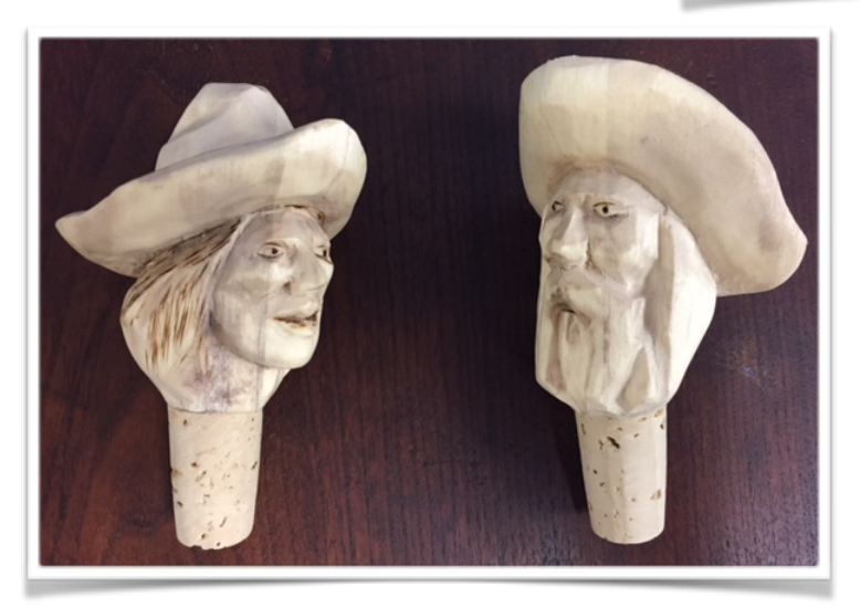
Fred carved two bottle stoppers.