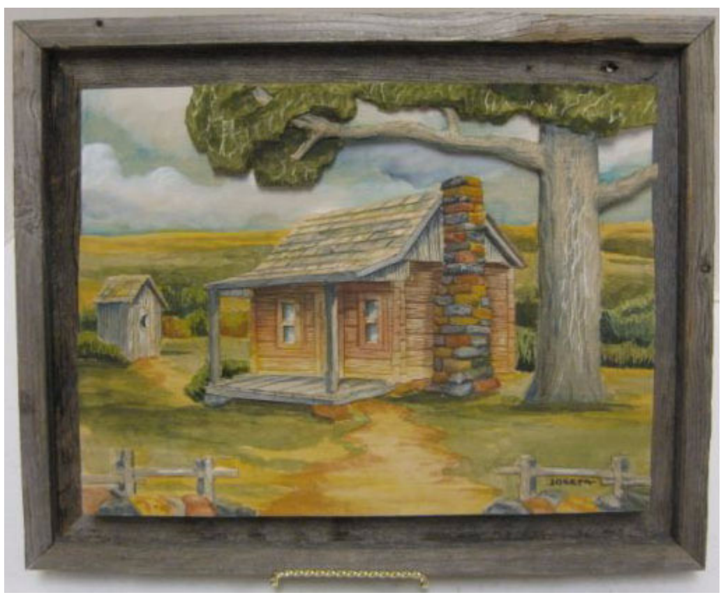
Marvin Joseph Relief with old barn wood frame