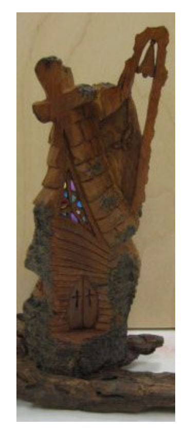
2 views of Cottonwood bark Chapel by Sue Sweeney