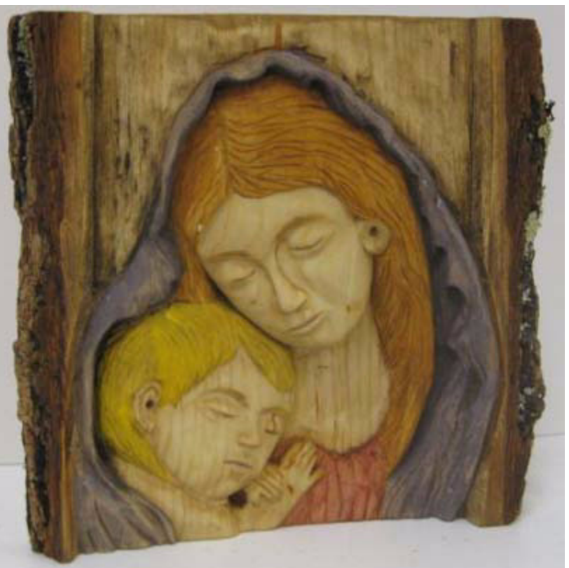
9" x 8" basswood relief finished in acrylics by Fred McLeroy

Next meeting Thursday, June 10 7:00 PM at the Austin Woodcraft store