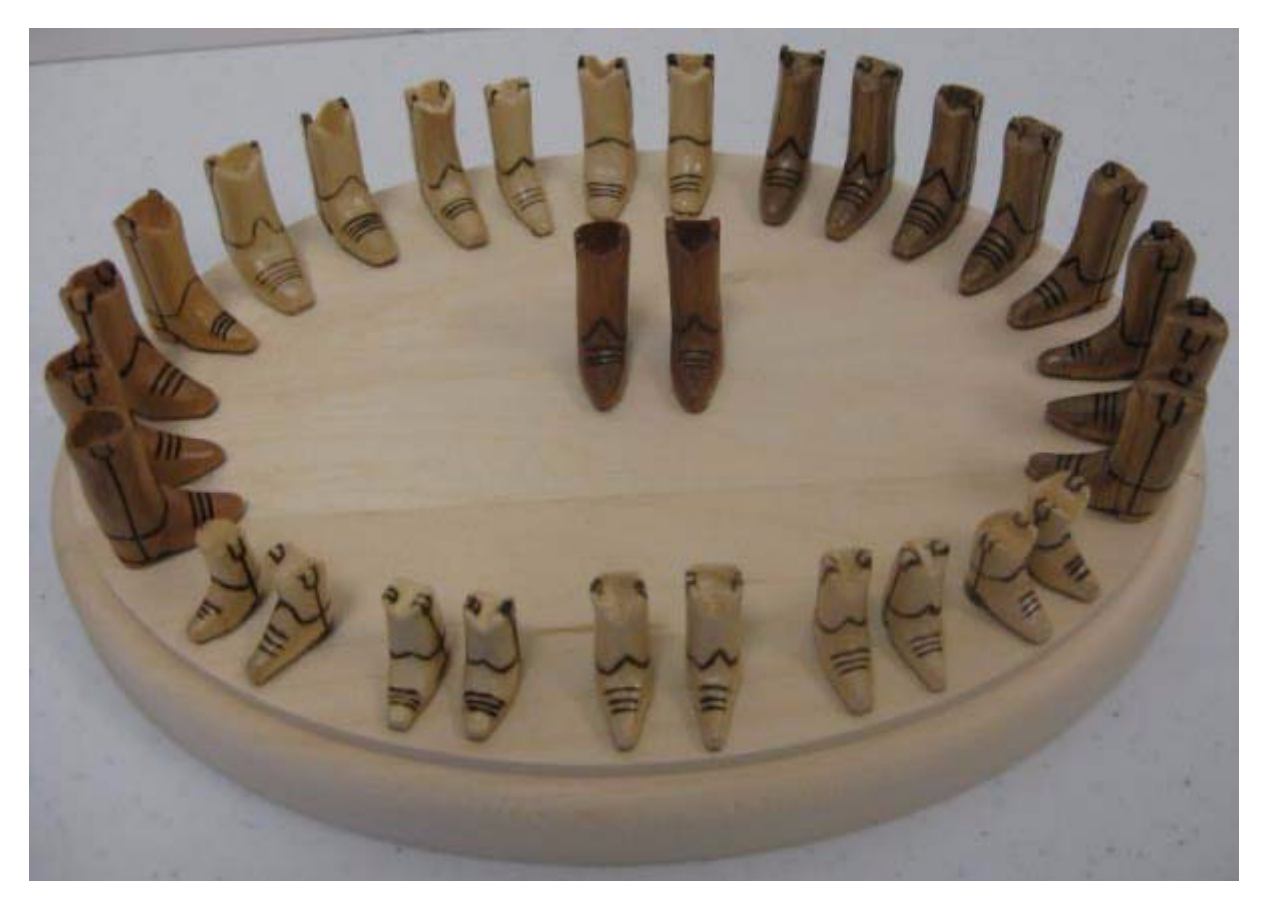
Boots range from 1/2" to Just over 1" tall in basswood, butternut, cherry, and mahogany on a 6" x 8" oval plaque by Clarence Born