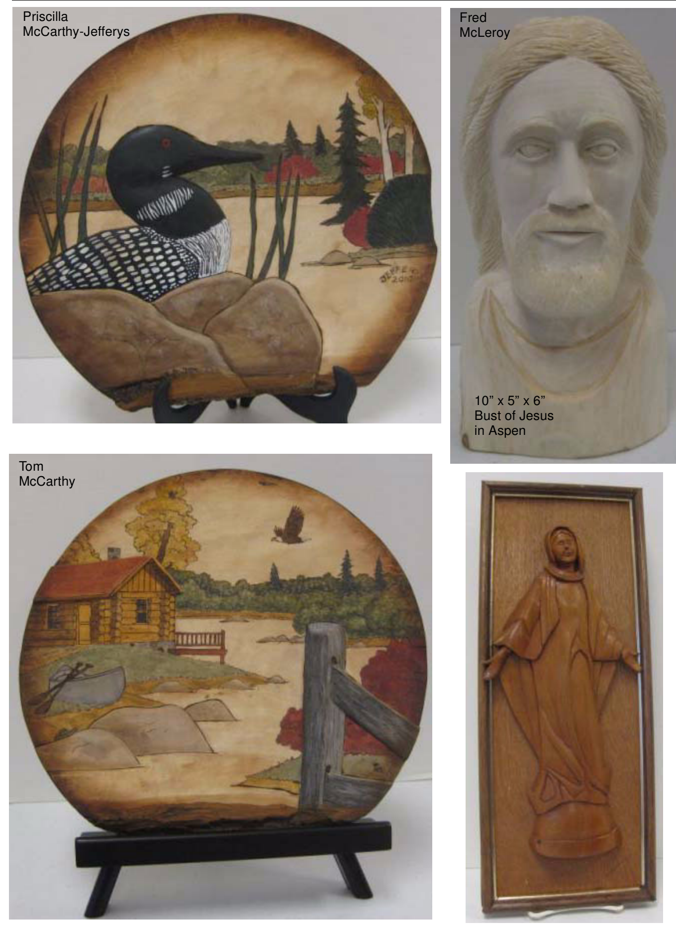
7" x 17" Madonna relief by Harvey Beauchemin