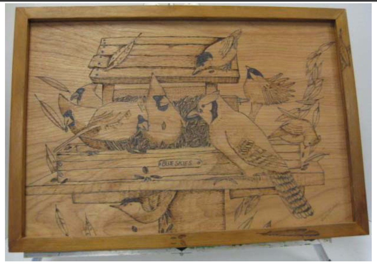
12" tall, 15" wide framed woodburning by Harvey Beauchemin