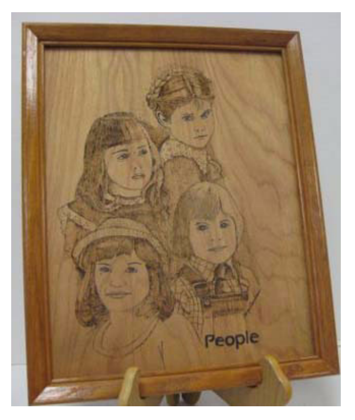
Framed woodburning 18" tall, 13" wide By Harvey Beauchemin