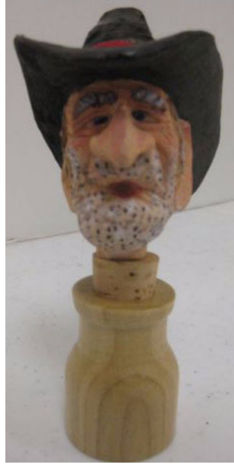
Example Bottle Stoppers as March Blank-of-the-Month by Cruz Rendon