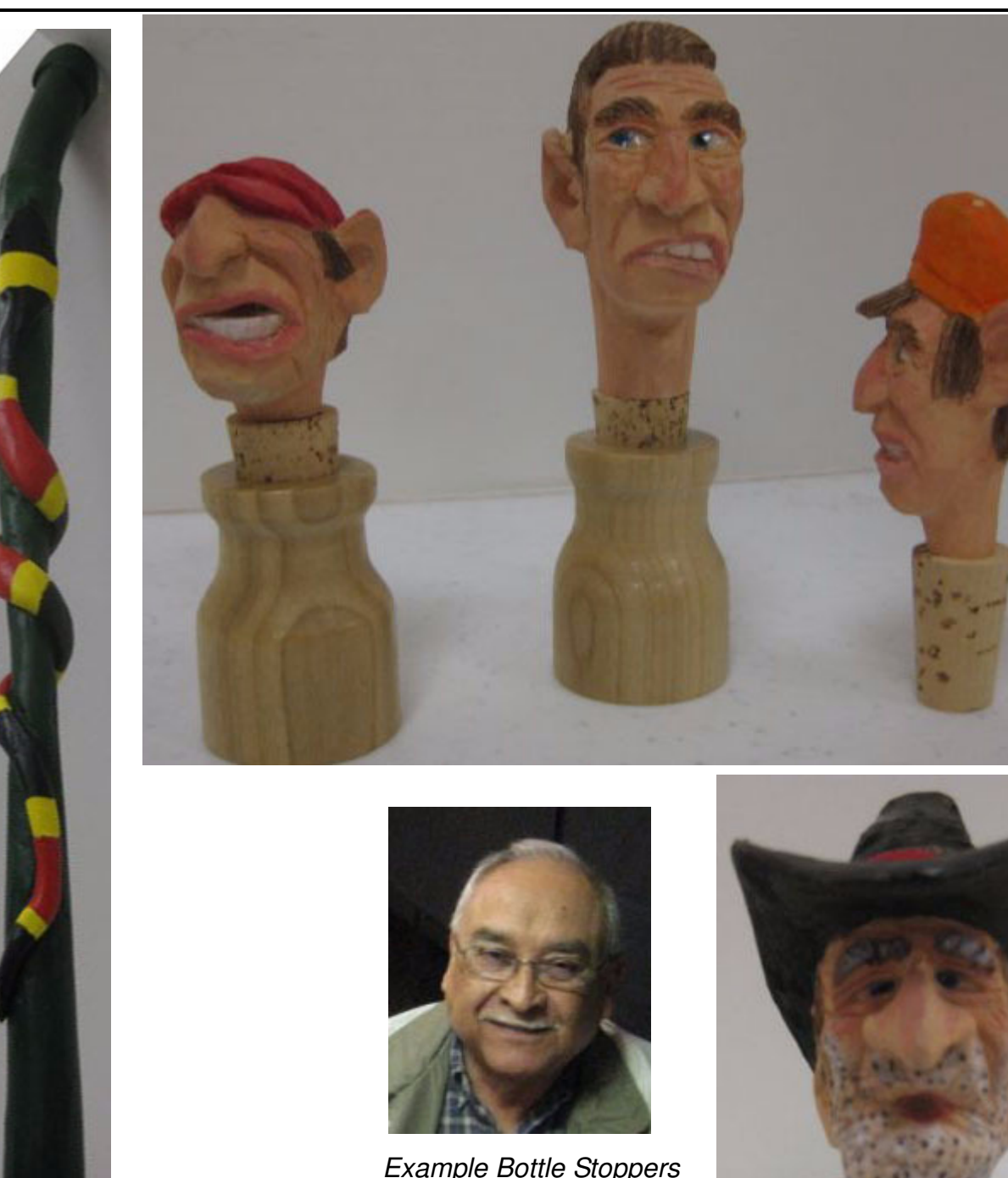
Coral Snake on Walking Stick