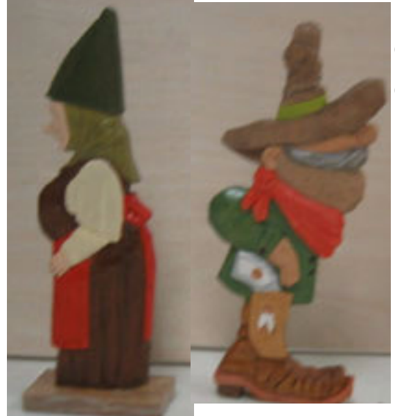
Clarence Born Carvings