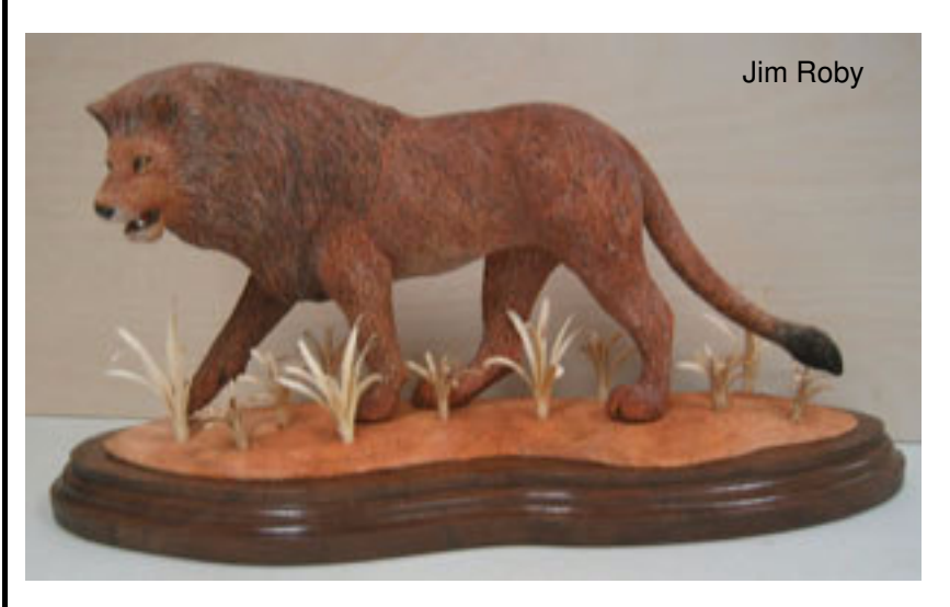
February Meeting Minutes

Next membership meeting April 10, 7:00 PM Austin Woodcrafters Store