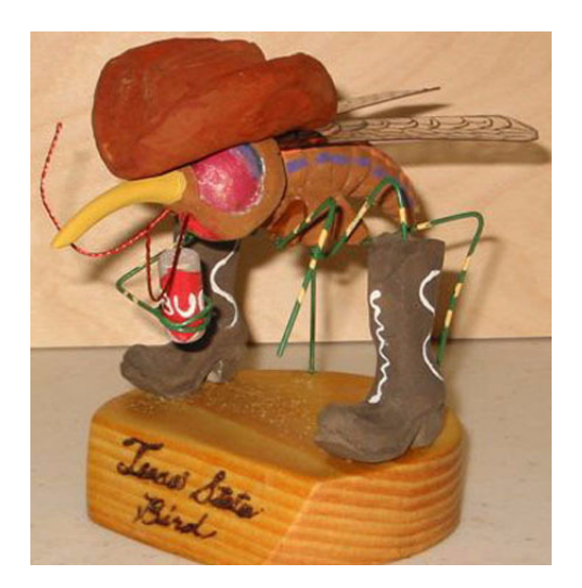
Texas State Bird By Tom Sarff

Our summer social carving schedule will be as follows: