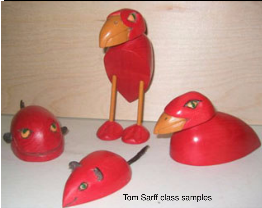
Tom Sarff class samples