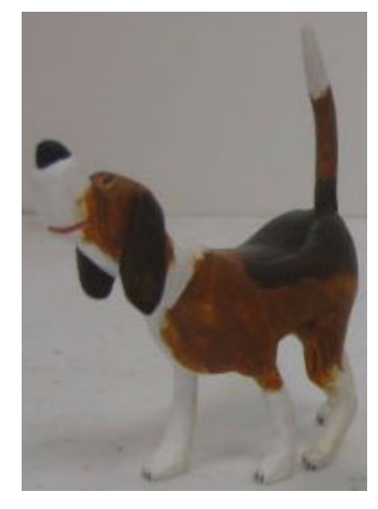
Example BOM Dog by Clarence Born

Next meeting Thursday, August 11 7:00 PM at the Austin Woodcraft store