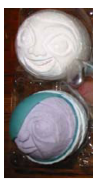
Bill Buckler Golf Ball