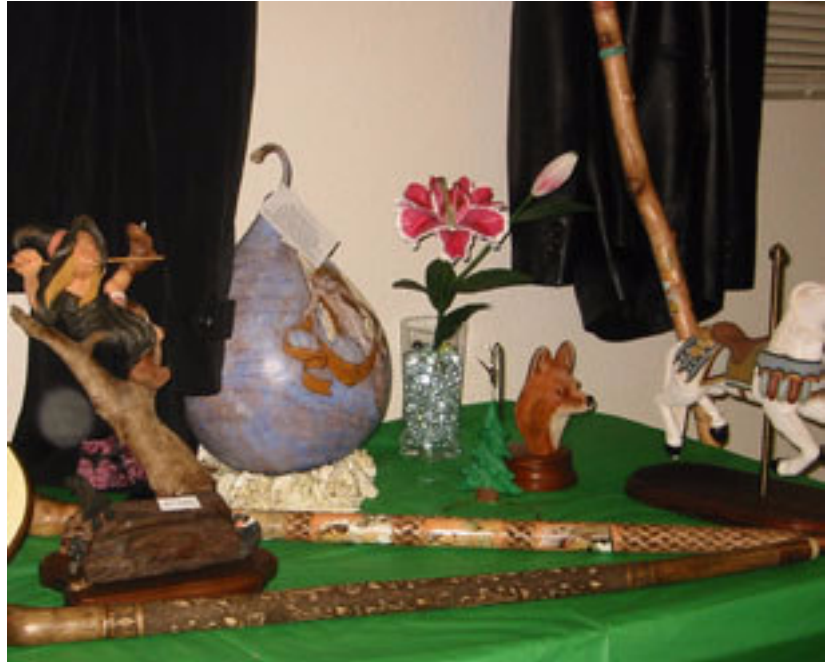
Christmas Party Highlights by Shirley Newman

Some 30 folks were present to enjoy delicious food, and lots of visiting during our Holiday Party the evening of December 12th at the Optimist Club.