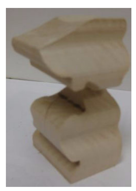
Blank of the month by Cruz Rendon