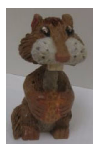
Example Chipmunk carved from August Blank of the month By Cruz Rendon