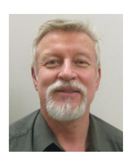
Carvings by Russell Schwausch