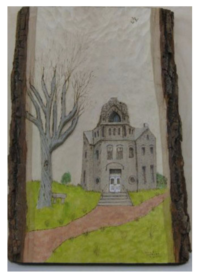
LaGrange Courthouse by Woody Hiebert