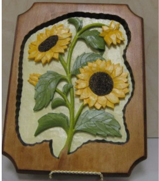
Sunflowers by Clarence Born