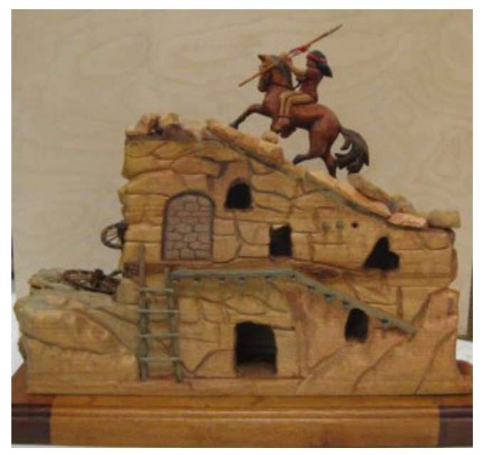
Second view of Johnny Dunlap's "Homeland Security"