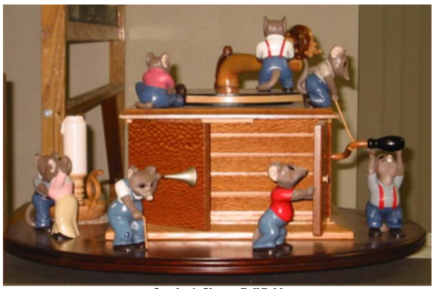
October's Show & Tell Table

Remember to renew your membership for next year. Membership form is on the back of the newsletter.