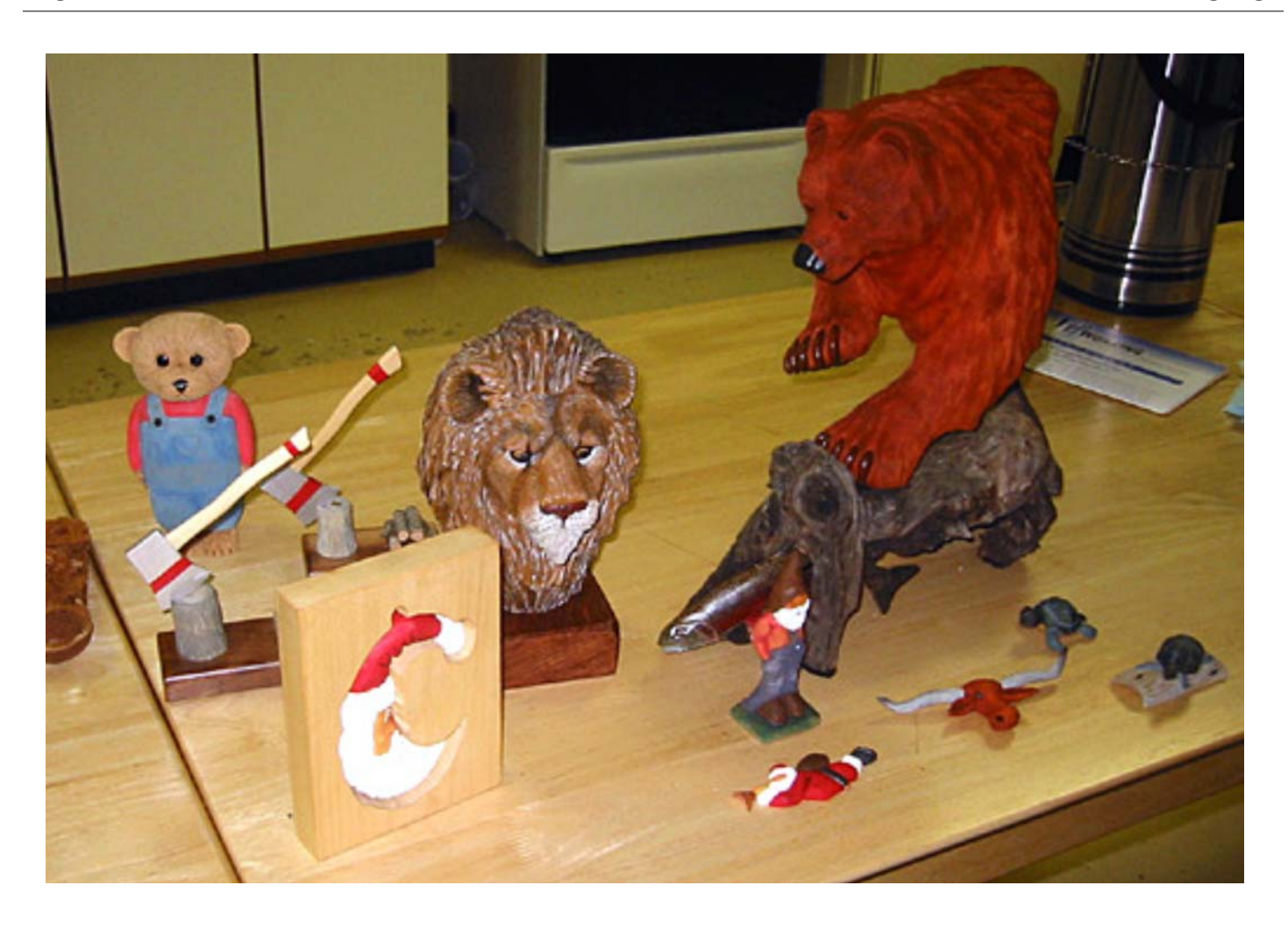
February Show & Tell Table