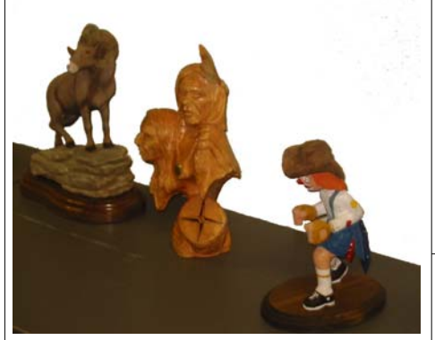
January's Show & Tell Table

When painting the eyes on your projects (usually last) I like to have a blow drier handy so I can dry quickly in order to finish faster. Use the Phil Bishop technique in paining the eye. It really works and looks nice.