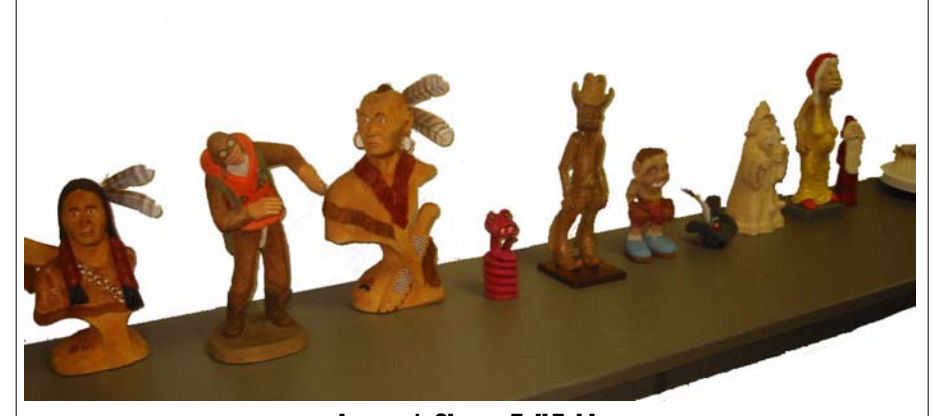
January's Show & Tell Table