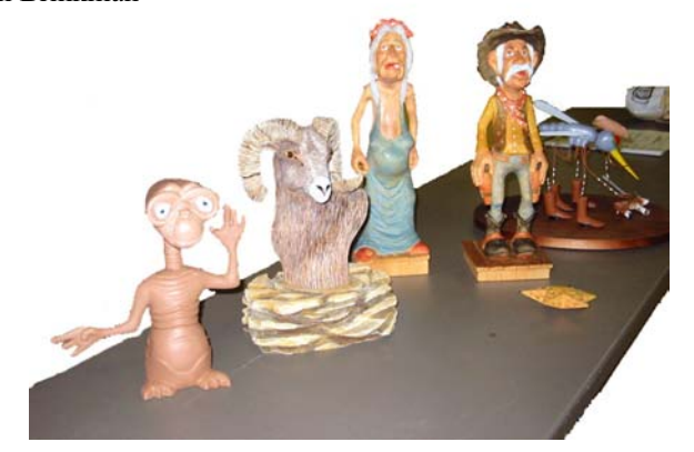
December Show & Tell Table