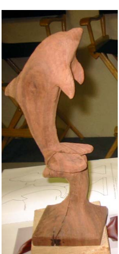
Buddy Streeman's Dolphin