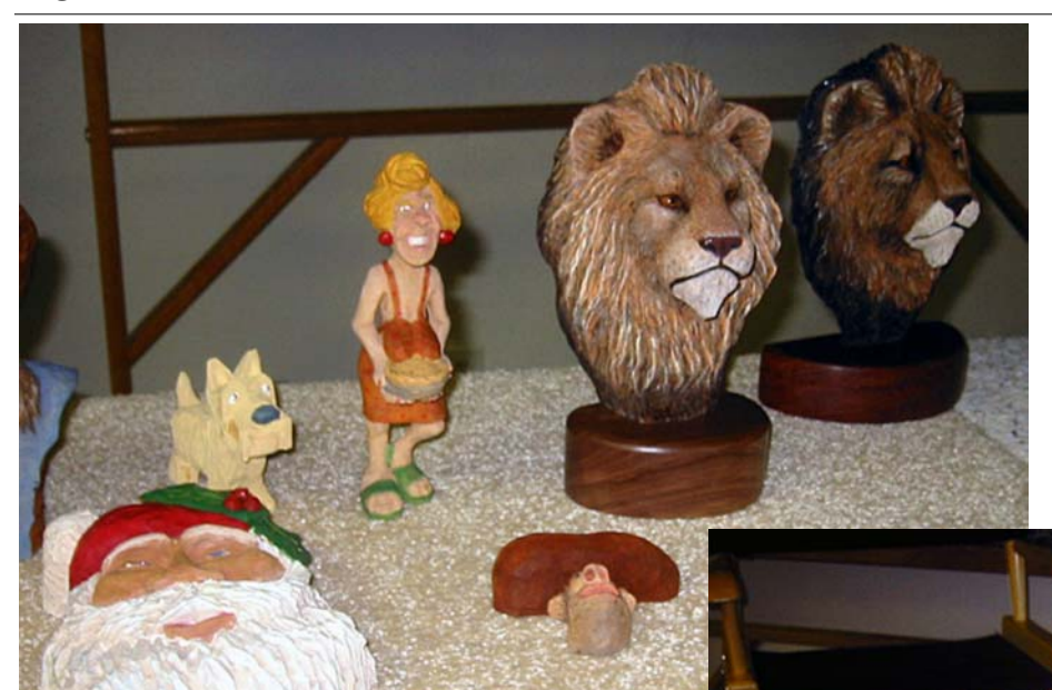
March Show & Tell Table