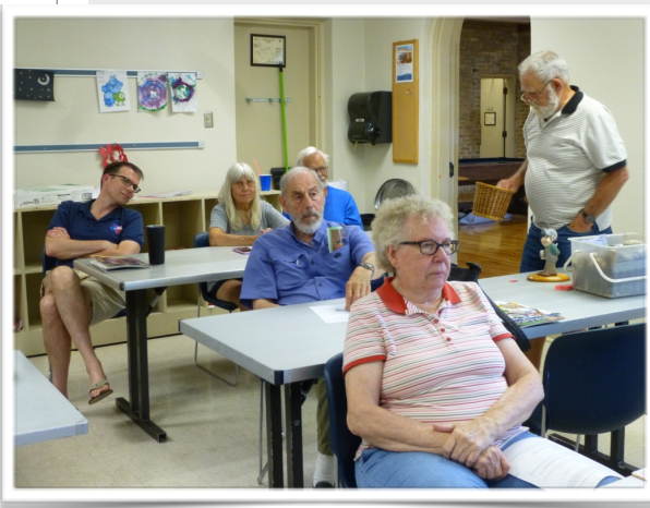
The Cutting Edge

Clarence said he will have a carving display at the Round Rock Public Library during July.