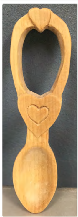
The Cutting Edge