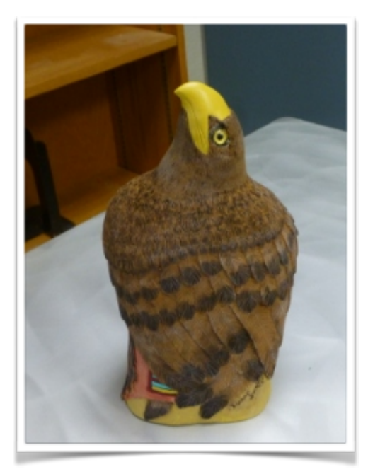
Shelley carved a Hoyt cane with an owl.