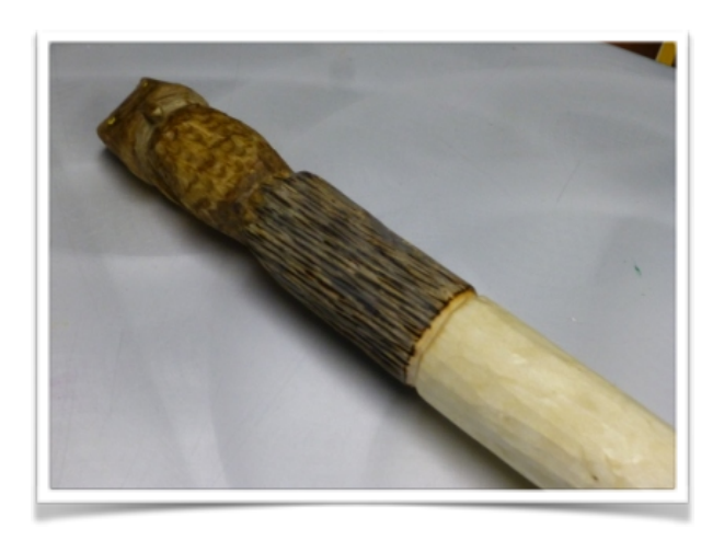
The Cutting Edge