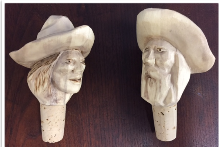
Fred carved two bottle stoppers.