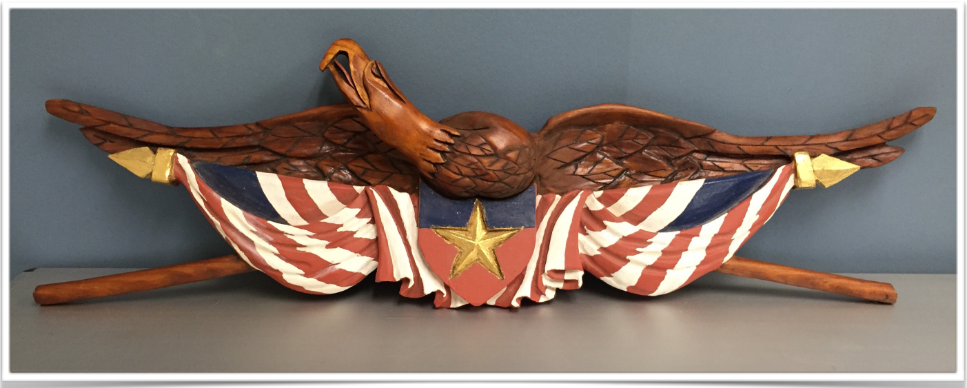
Larry carved two large reliefs; one of an arm, with hand pointing up; the other an eagle over a furl of an American flag.